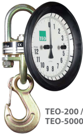
TEO-200 / TEO-5000

The REMA TEO mechanical crane scale with one suspension eye and hook with safety latch up to 5,000 kg and from 12,500 kg up to 85,000 kg with 2 eyes.